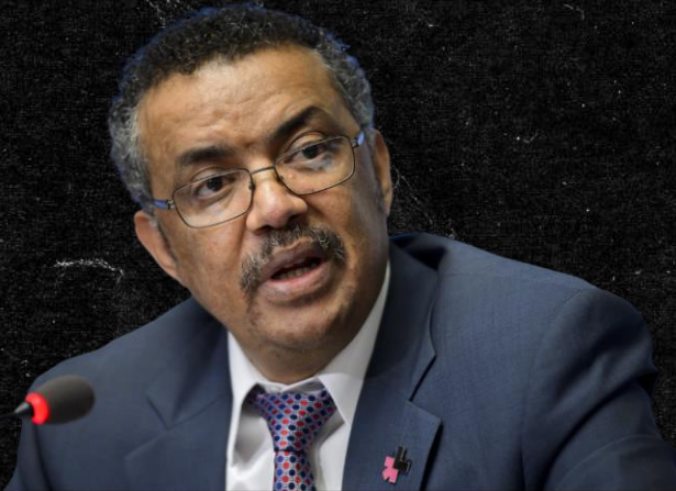
Tedros Adhanom Ghebreyesus, Director-General of the World Health Organization

Our biggest challenge is ensuring people have access to high-quality, affordable medicines.